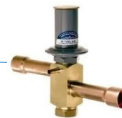
Hot gas bypass to cater for low load